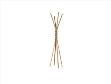
CANCAN COAT STAND