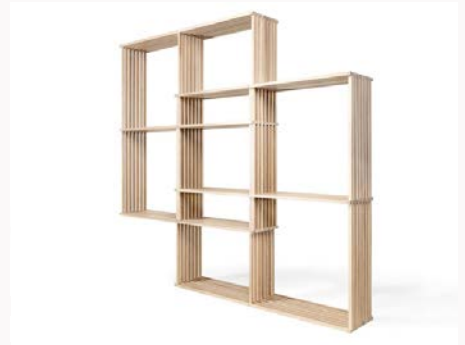
X2 SMART SHELF