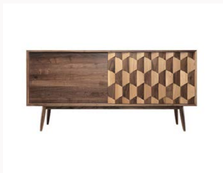
SCARPA W SIDEBORD