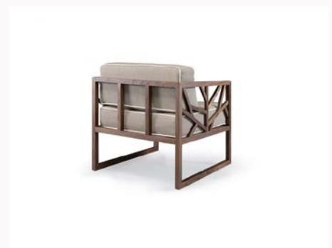
TREE CHAISE LONGUE