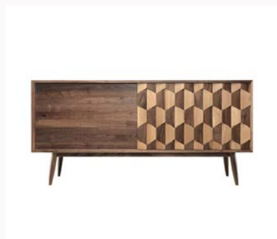
SCARPA W CHAISE LONGUE