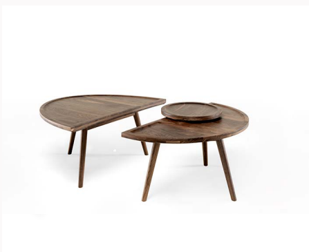
COLOMBO SIDE / COFFEE TABLE